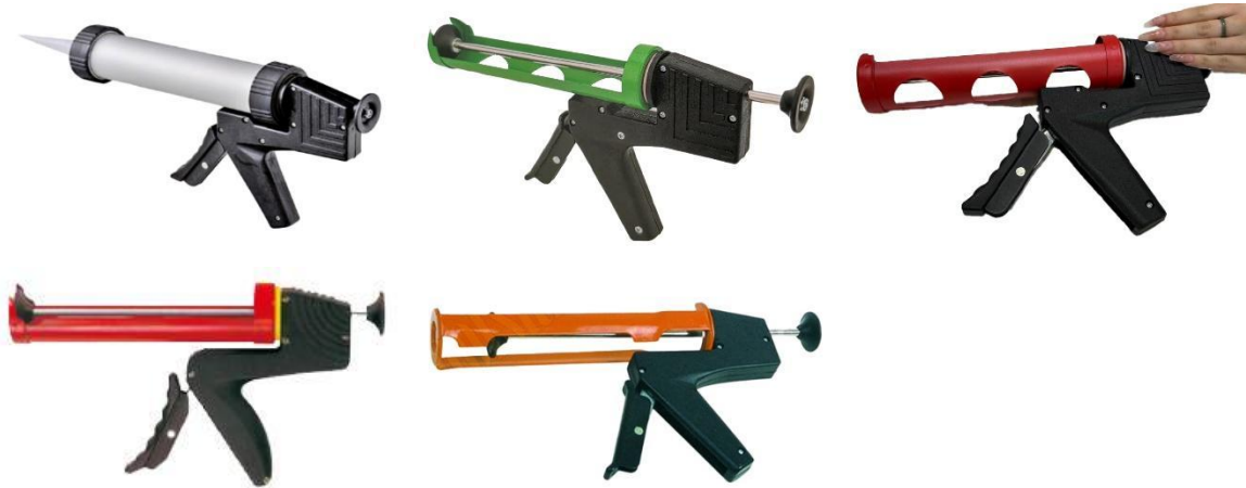
Figure 1: detected copies at the Eisenwaren Messe

One counterfeiter, Jiangsu GTIG Huatai Co. of China, initially refused to sign a cease-and-desist declaration. However, as a result of medmix's significant sales, marketing, and enforcement efforts regarding its MK H14 dispenser, the District Court of Cologne granted, on March 5, a preliminary injunction ("einstweilige Verfügung") for medmix Switzerland Ltd. (plaintiff) against Jiangsu GTIG Huatai Co. (defendant, "GTIG"), forbidding the infringer from offering and selling in Germany the below copy of medmix's visually distinctive MK H14 dispenser: