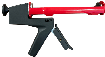
Figure 3: original MK H14 RS dispenser from medmix.

This recognition was particularly significant for medmix, as it reinforced again the strength and enforceability of its rights on the MK dispensers in Germany, confirmed the likelihood of consumer confusion in the marketplace, and served as a strong precedent again supporting medmix’s broader enforcement strategy against unfair competition.