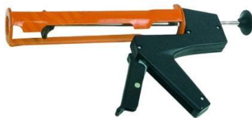
Figure 2: copy of medmix's MK H14 dispenser, by Jiangsu GTIG Huatai Co.

One counterfeiter, Jiangsu GTIG Huatai Co. of China, initially refused to sign a cease-and-desist declaration. However, as a result of medmix's significant sales, marketing, and enforcement efforts regarding its MK H14 dispenser, the District Court of Cologne granted, on March 5, a preliminary injunction ("einstweilige Verfügung") for medmix Switzerland Ltd. (plaintiff) against Jiangsu GTIG Huatai Co. (defendant, "GTIG"), forbidding the infringer from offering and selling in Germany the below copy of medmix's visually distinctive MK H14 dispenser: