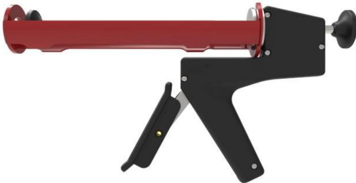
Figure 5: original MK H14RS from medmix.

medmix therefore strongly recommends that its customers look for the unique MK trade dress of its dispensers, with the MK trademark stamped on the distinctive handle of the MK dispensers (shown below for an MK H14 RS dispenser), to be assured that they are purchasing a high-quality MK dispenser manufactured according to medmix's strict quality control measures and protected by its guarantee.